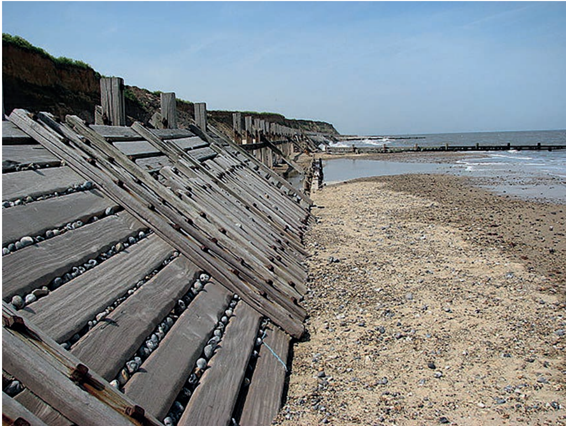
Fig. 1.8 for Question 1 Sea wall